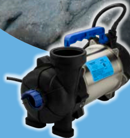
AquascapePRO Pond Pumps