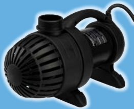
AquaSurge® Pond Pumps