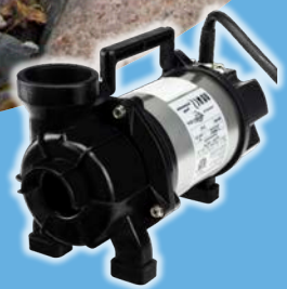
PL and PN Pond Pumps