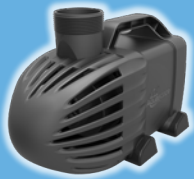
EcoWave Pond Pumps