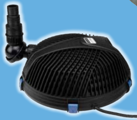
AquaForce® Pond Pumps